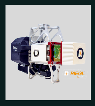
True View 635/640 <u>LEARN MORE</u>