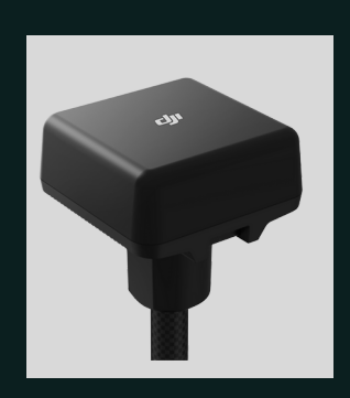
DJI RTK Base Station LEARN MORE