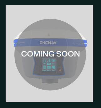
i83 GNSS System LEARN MORE