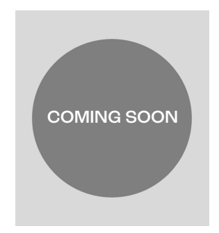
UGCS LEARN MORE