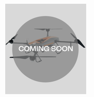
BB4 Multi rotor drone LEARN MORE