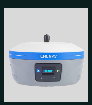
iBase LEARN MORE