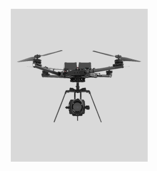
FREEFLY ALTA X LEARN MORE