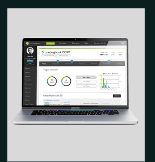
Drone Logbook Fleet Management Software LEARN MORE