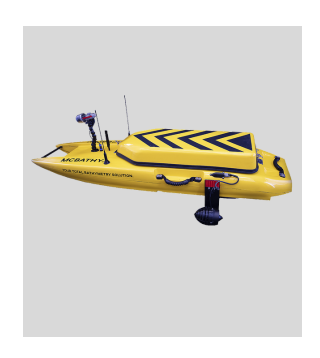
McBathy single beam LEARN MORE