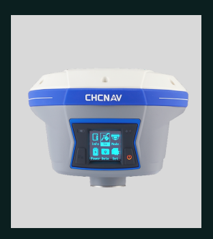
i90 Pro GNSS System LEARN MORE