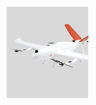
P330 VTOL Drone LEARN MORE