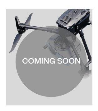
TDOT LEARN MORE