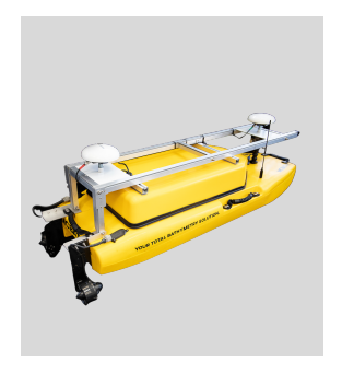
McBathy side scan <u>LEARN MORE</u>