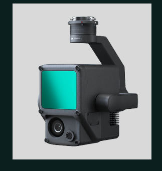
Zenmuse L1 LEARN MORE