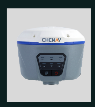
i50 GNSS System LEARN MORE