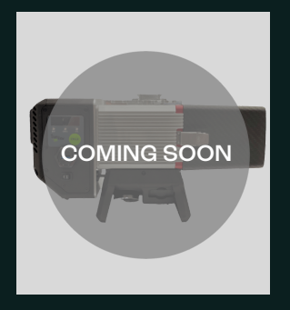
True View 645/650 LEARN MORE