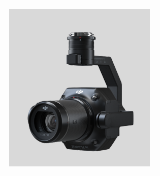
Zenmuse P1 LEARN MORE