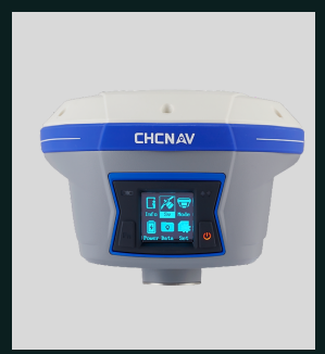
i90 GNSS System LEARN MORE