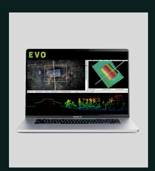
True View EVO Software