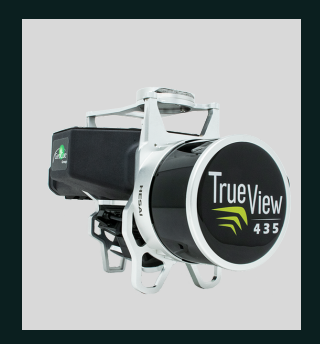
True View 435 LEARN MORE