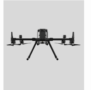
DJI M300 LEARN MORE