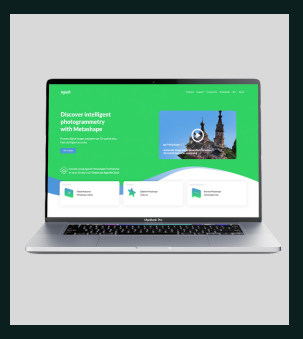
Agisoft Metashape Software