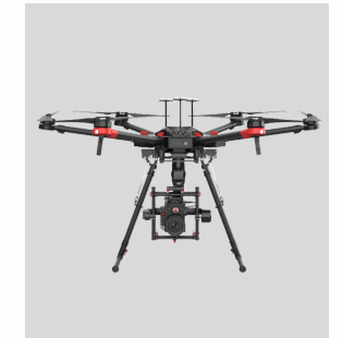
DJI M600 LEARN MORE