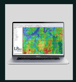
GeoCue LP360 Software