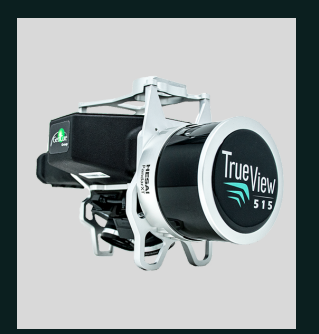
True View 515 LEARN MORE