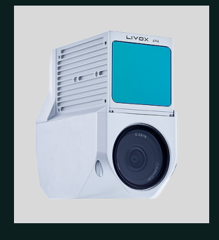
Alpha Air 450 LEARN MORE